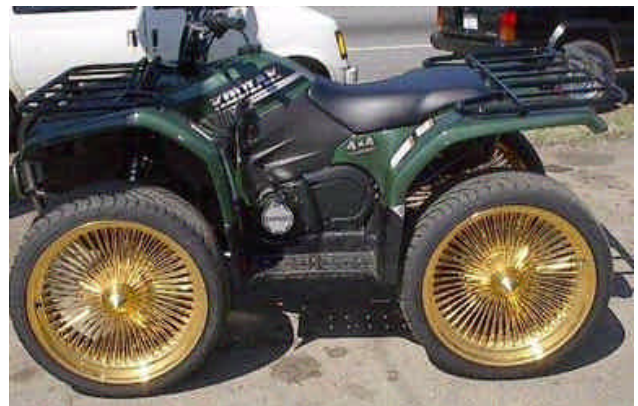
This is to show you don't have to own a Gold Wing to spend a lot of money on your rig!

16. Caterpallor (n.): The color you turn after finding half a grub in the fruit you're eating.